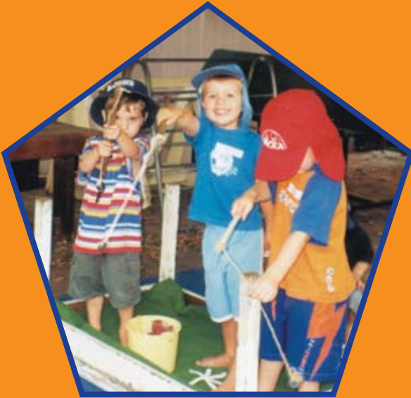
A day fishing

Hours: Monday to Friday 7.30am to 9.00am 2.00pm to 4.30pm