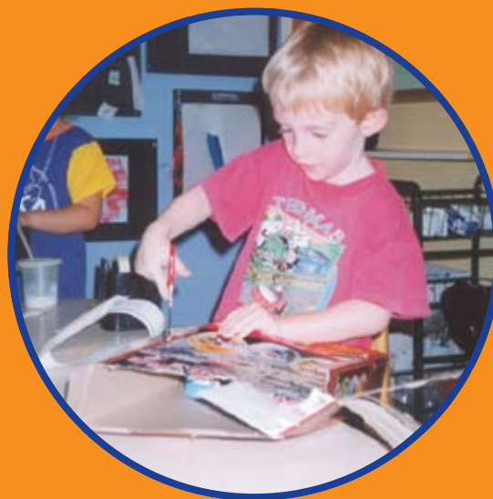
Constructing equipment for a trip to space

Programs reflect current early childhood education theory and practice.