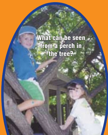
What can be seen from a perch in the tree?

Our indoor and outdoor play spaces are specifically designed for children from 3 years of age and are nestled amongst established trees and gardens.