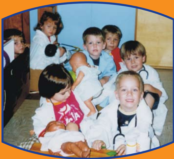
Filled with doctors, the ambulance rushes the sick babies to the hospital

We foster the belief that children are competent, capable learners and we respect their individual differences.